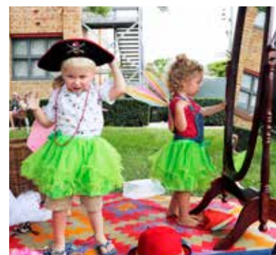
Free Art January, 2017