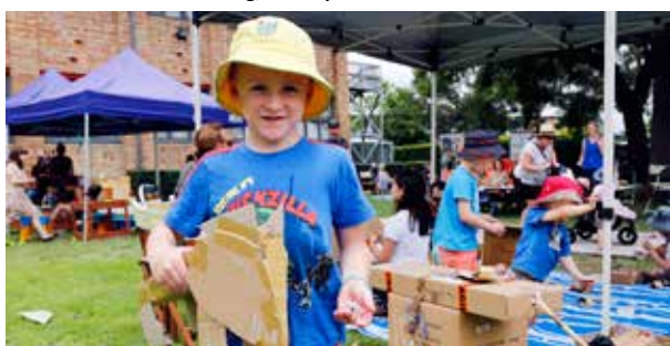
Free Art January, 2017