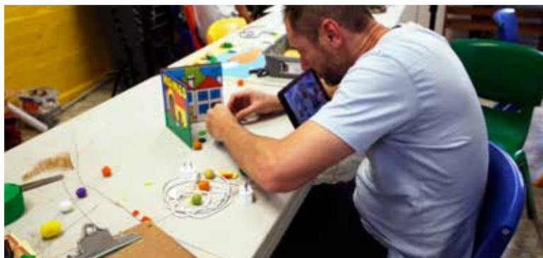
Animation Spectacular workshop, Saturday 21 January

Maitland Regional Art Gallery is proudly supported by: