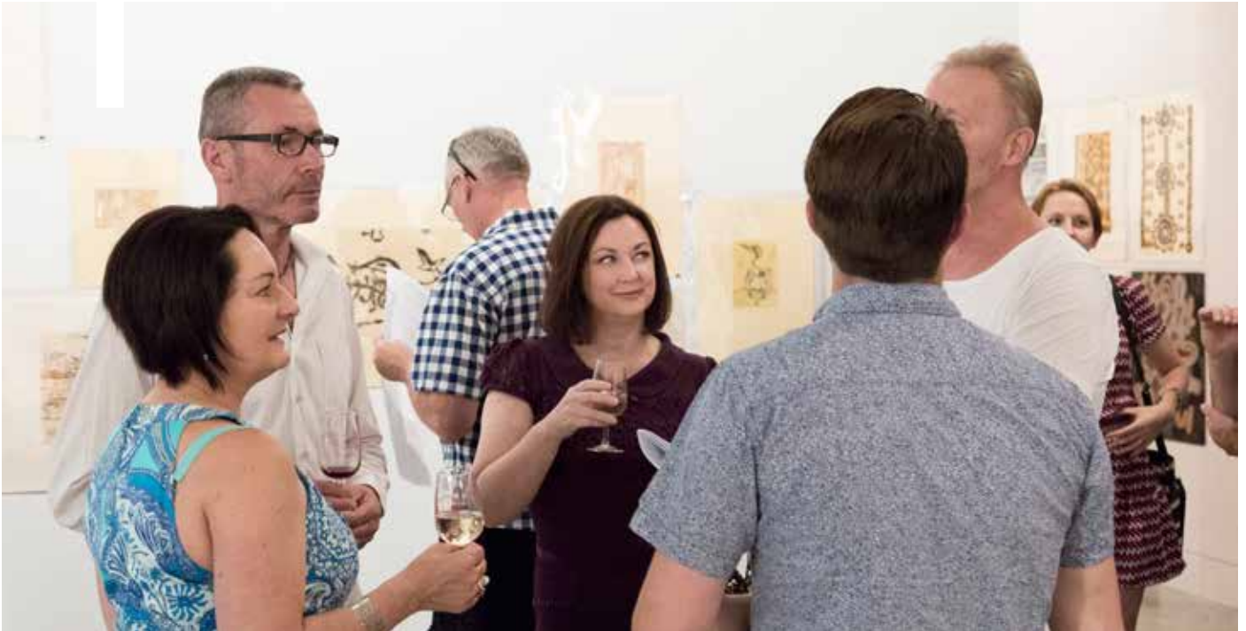
Director's Choice MRAGM Art Sale, 4 November 2016

Welcome to the Autumn edition of ARTEL. In the time gap between the deadline, submitting an article the printing and distribution of the magazine, much can happen – as was the case in the interval between me putting pen to paper and you receiving your Summer copy ARTEL, Summer 2017.