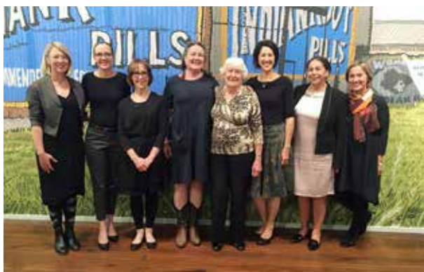
MRAGM Annual General Meeting, Thursday 20 October 2016