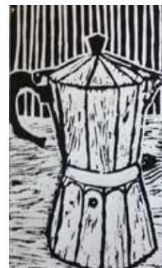
Coffee pot lino print by Manus