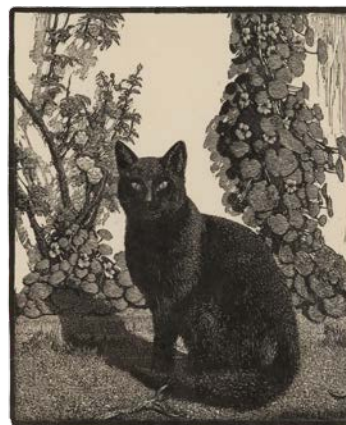
Lionel Lindsay, The Black Cat , 1922 wood engraving printed in black ink on paper

six. a firm cardboard cylinder as a roller the inside of plastic film wrap is good