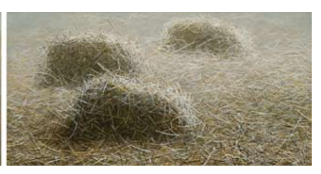
Hanna Kay Ebb & Flow 1 2008 digital photograph + oil paint on canvas 66 x 268cm