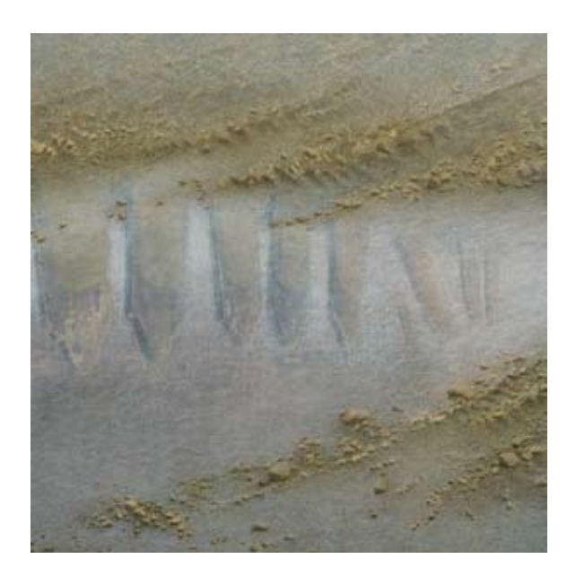
Hanna Kay Watercourse 7 2008 digital photograph + oil paint on canvas 66 x 66cm