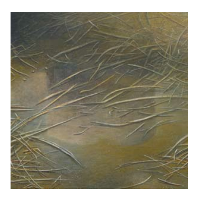
Hanna Kay Watercourse 8 2008 digital photograph + oil paint on canvas 66 x 66cm