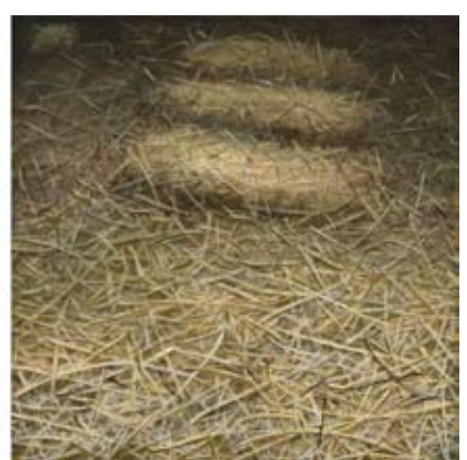
Hanna Kay Ebb & Flow 2 2008 digital photograph + oil paint on canvas 66 x 278cm