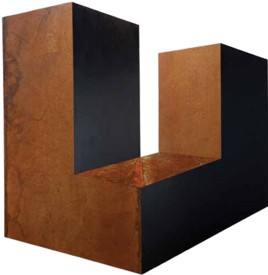
PAUL SELWOOD : A complex silence 2009, steel, varnish, 242.5 x 245cm