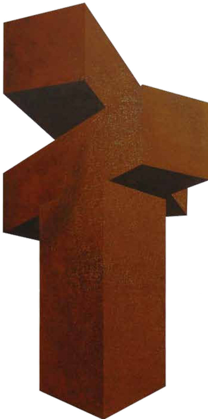
PAUL SELWOOD : Mainstay 2008, steel, varnish, 242.5 x 122.5cm