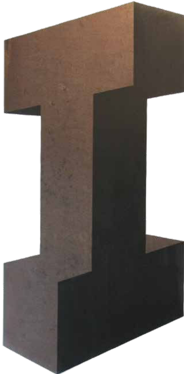
PAUL SELWOOD : Crux 2009, steel, varnish, 197.5 x 100cm