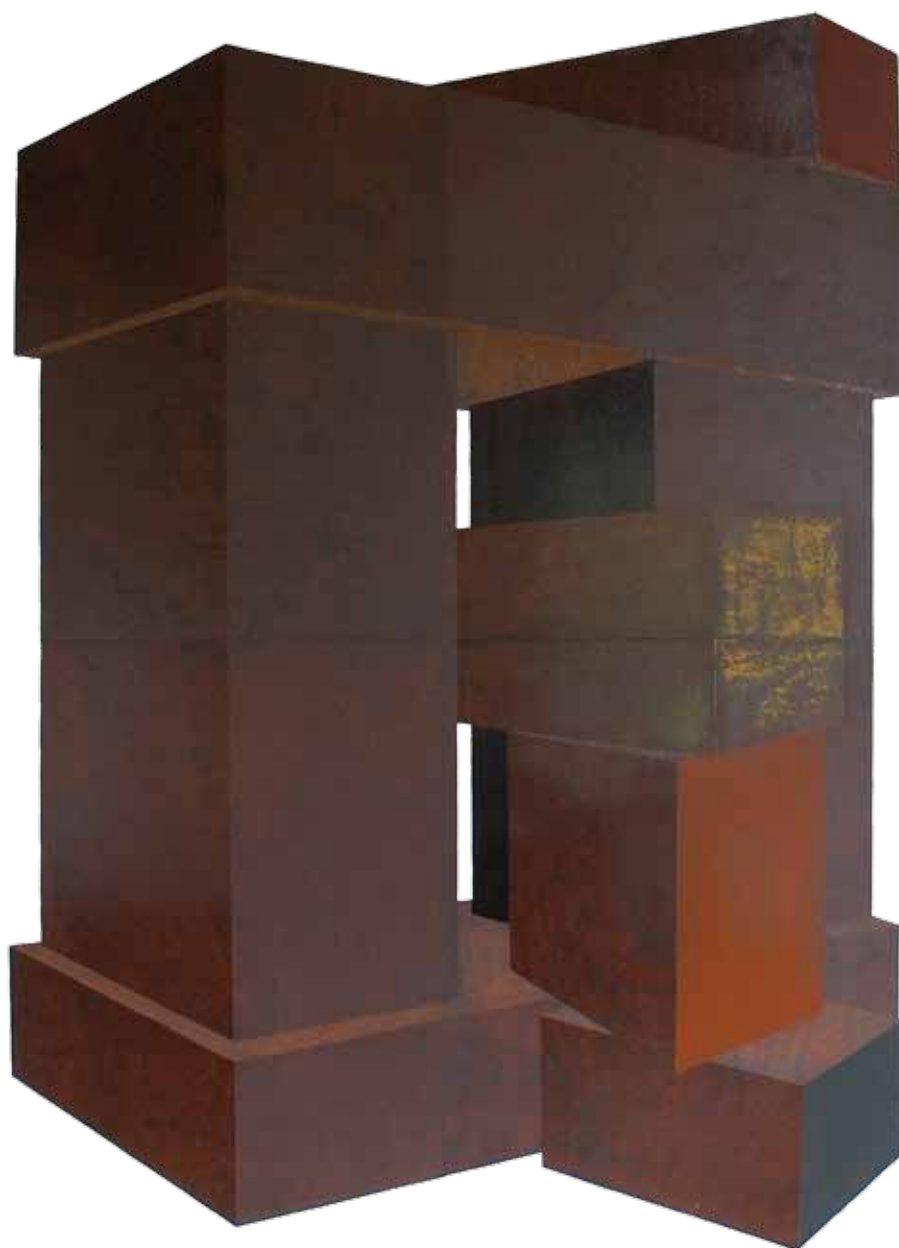
PAUL SELWOOD : A story and its telling , 2010, steel, rust and varnish, 190 x 110 cm