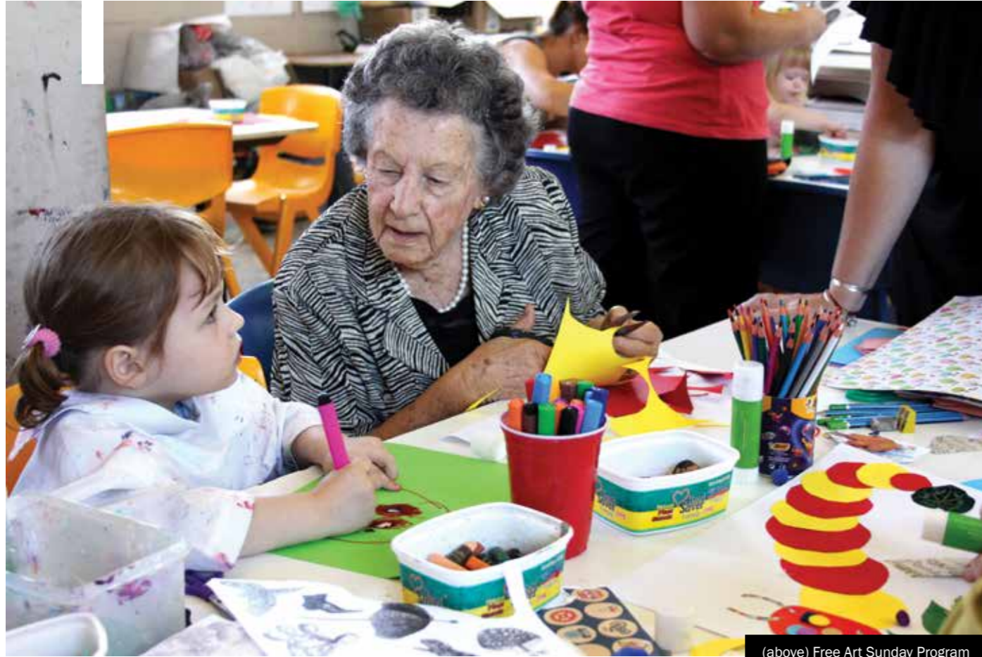
(above) Free Art Sunday Program

One of the fun opportunities available to all who visit Maitland Regional Art Gallery is to drop in on a Sunday around 11am and join the Art Sunday program in the Art Factory which is sponsored by MRAG Members.