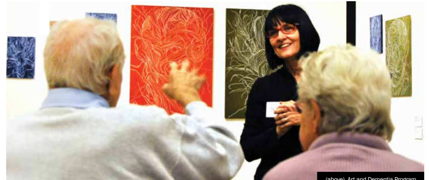
(above) Art and Dementia Program

Cultural activities in Maitland and particularly Maitland Regional Art Gallery (MRAG) are supported in a number of ways, both financially and in kind. As a part of Maitland City Council (MCC), MRAG continues to be supported and funded by the Council. Additional funding is also received from the NSW Government and the Department of Trade Investment and the Arts as well as other one-off grants from philanthropic groups, such as the Thyne Reid Foundation.