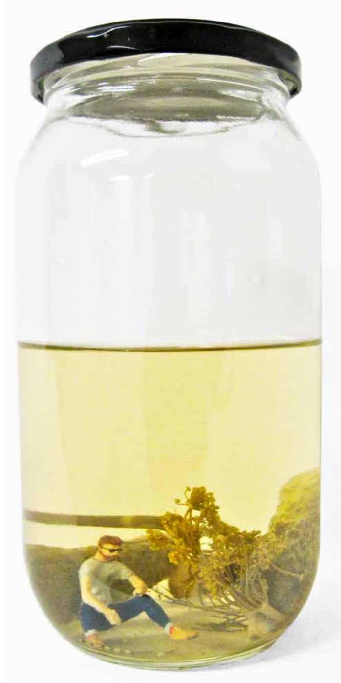
Will French Self portrait with pickles 2013

Hand carved enamel-painted alloy figure, gherkins, brine, dill in 1-litre glass jar 18 x 9 cm