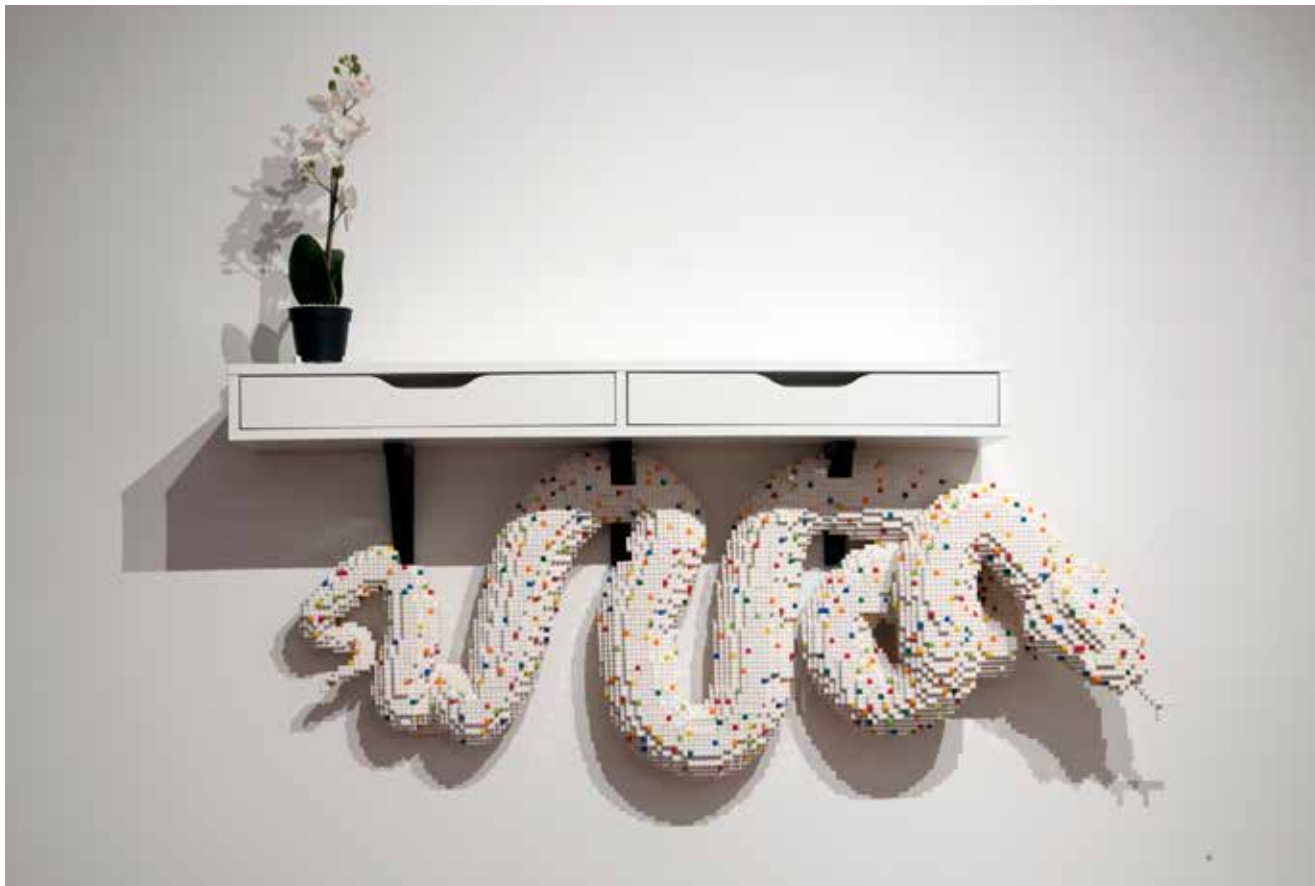
Claire Healy & Sean Cordeiro Hallway / Rear Entrance – Snake 2014

Lego, IKEA shelf with drawers and plant 147 × 115 × 30 cm