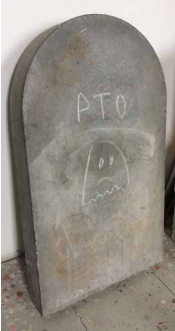
Will French Please turn over, please (sketch) 2014 Chalk on cast concrete 75 x 45 x 9 cm