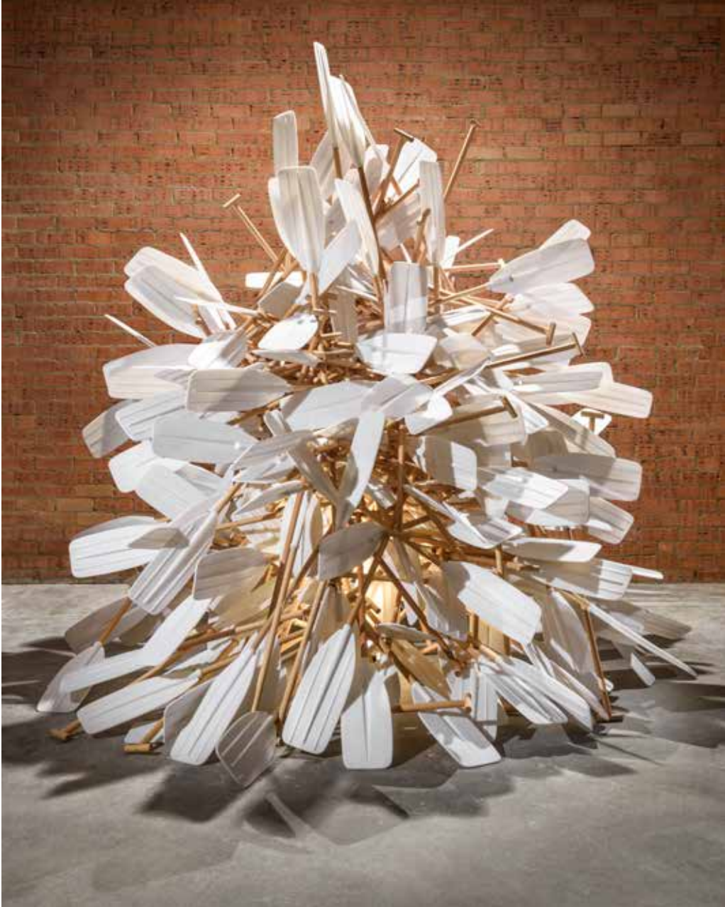
Alex Seton Someone Else's Problem 2015

Marble dust, epoxy resin, Tasmanian Oak, cable ties Dimensions variable (approximately 300 x 200 x 200 cm)