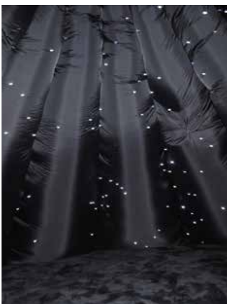
Keg de Souza Living Under the Stars 2012