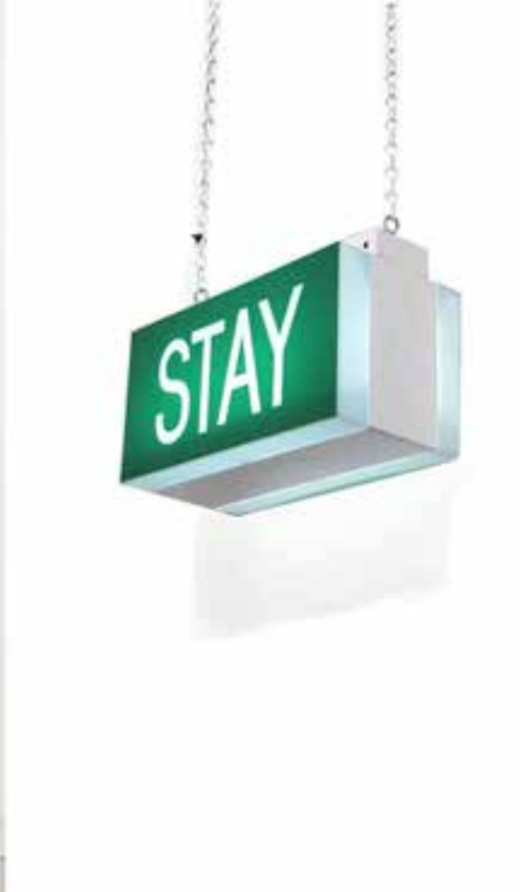
Will French Just a little bit longer 2013

Exit sign light box with translucent green vinyl 15 x 30 x 12 cm