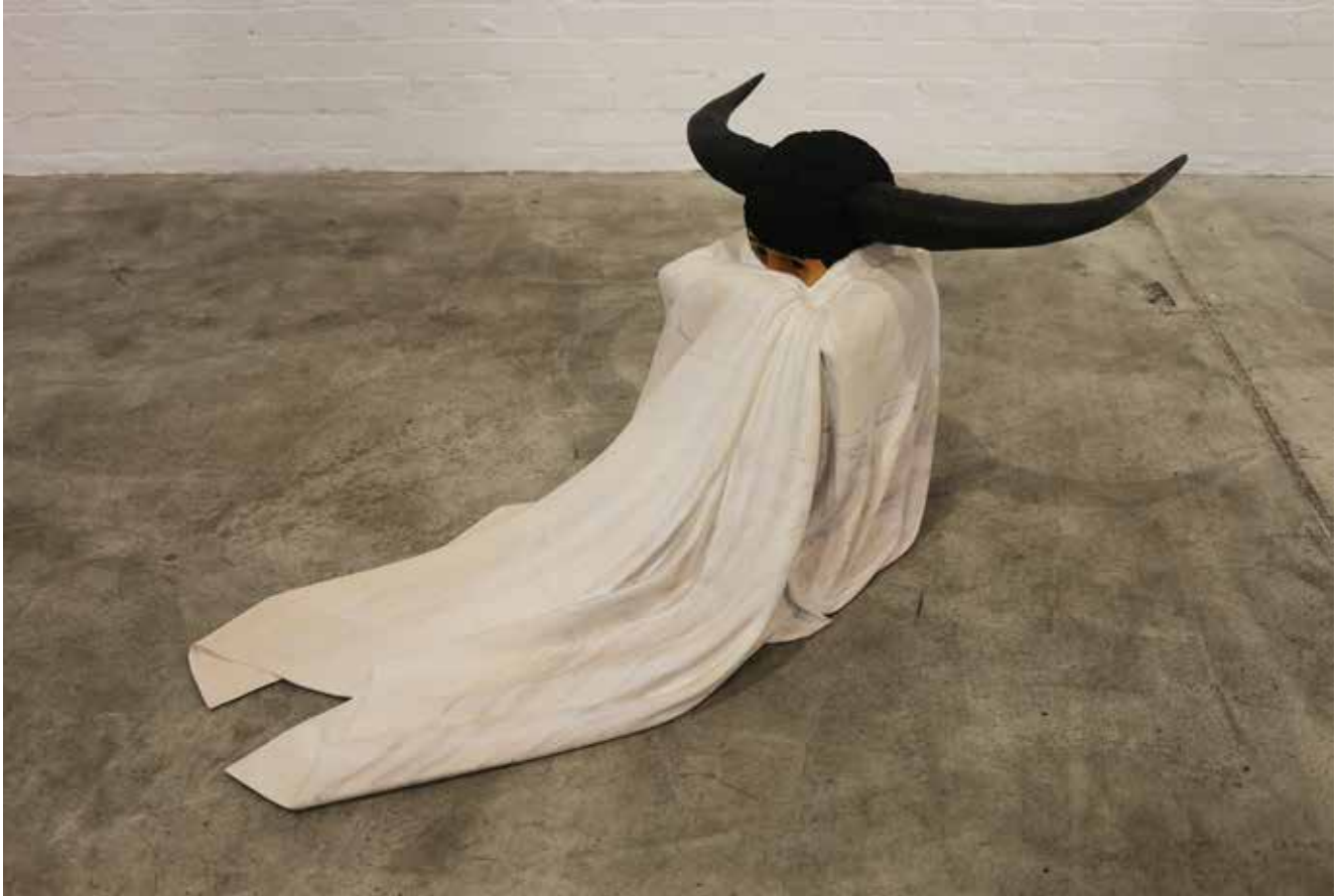
Abdul-Rahman Abdullah The boy who couldn't sleep 2017

Painted wood, buffalo horn 56 x 127 x 74 cm