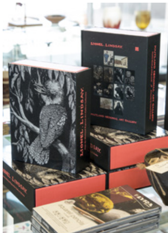
Greeting card box set.