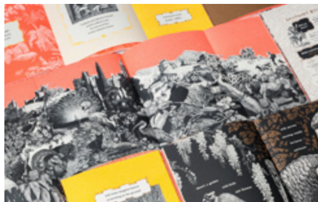
Selected spreads from Lionel's Place Story book.