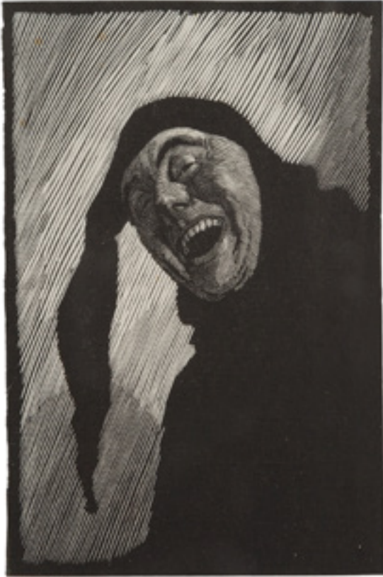
Lionel Lindsay, The Jester , 1923, wood engraving, printed in black ink on paper, 14.5 x 9.6cm.

Lionel Lindsay was born in Creswick, Victoria in 1874 and died in Wahroongah, NSW in 1961. Lindsay was one of ten children, five of whom became professional artists - including his younger brother Norman Lindsay. After spending 22 years as a cartoonist and illustrator for newspapers and magazines Lionel Lindsay became a full-time artist. He became a successful and prolific printmaker which funded his passion for his work and travel.