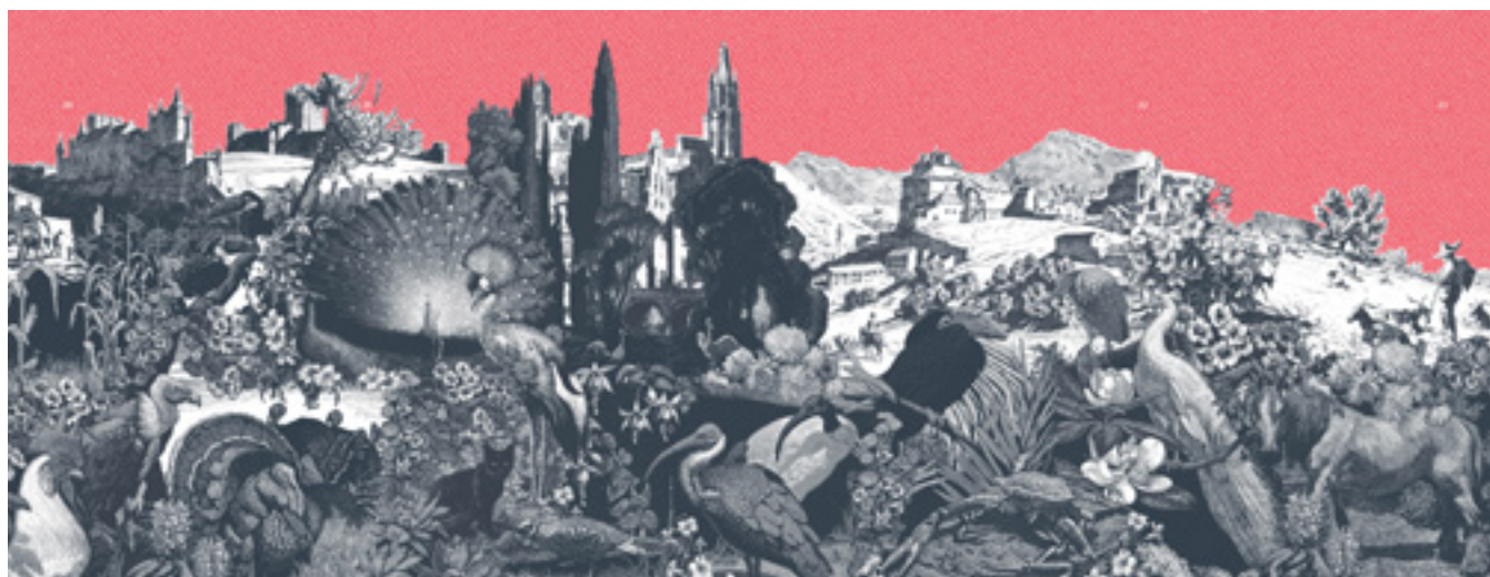
Fold out montage included in Story book.