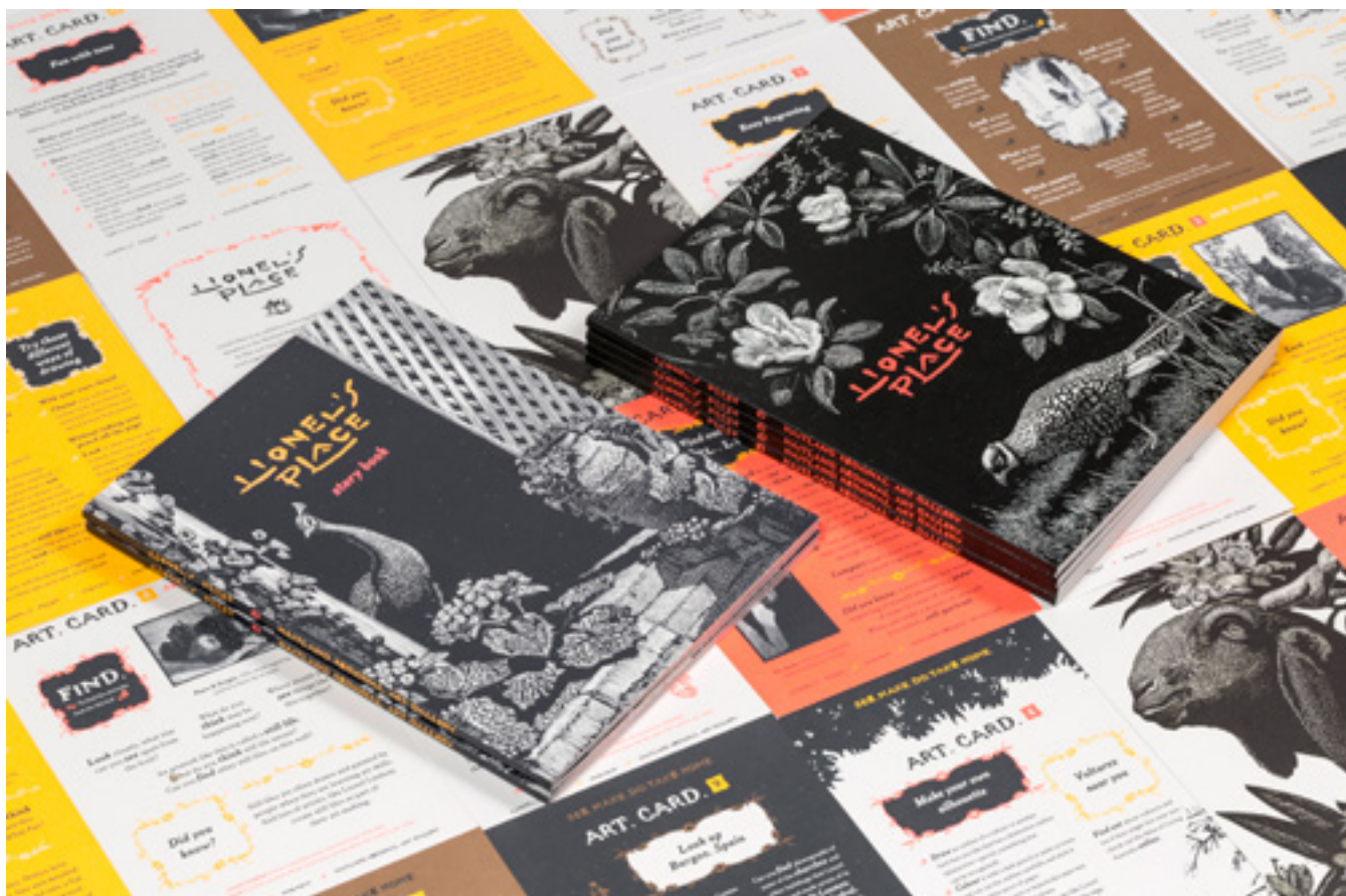
Art Cards, Story book and catalogue.