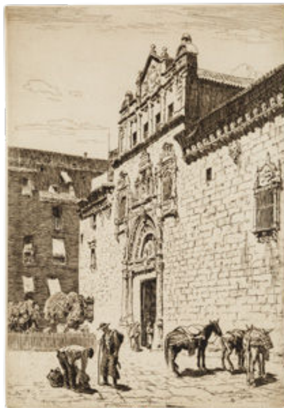
Lionel Lindsay (top left) The Little Balcony , 1921, etching, in black ink on paper, 10.4 x 5.9cm. (lower left) A Courtyard, Segovia , 1929, etching, printed in black ink on paper, 25.2 x 17.6cm. (right) Santa Cruz, Toledo , 1945, etching, printed in black ink on paper, 25.2 x 17.6cm.