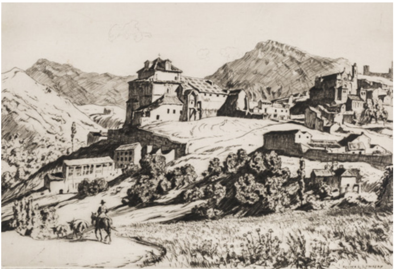
Lionel Lindsay, Old Antequera, Andalusia, Spain , 1929, drypoint etching, printed in black ink on paper, 22.5 x 30cm.