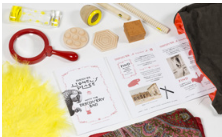
Discovery bag sensory pack.