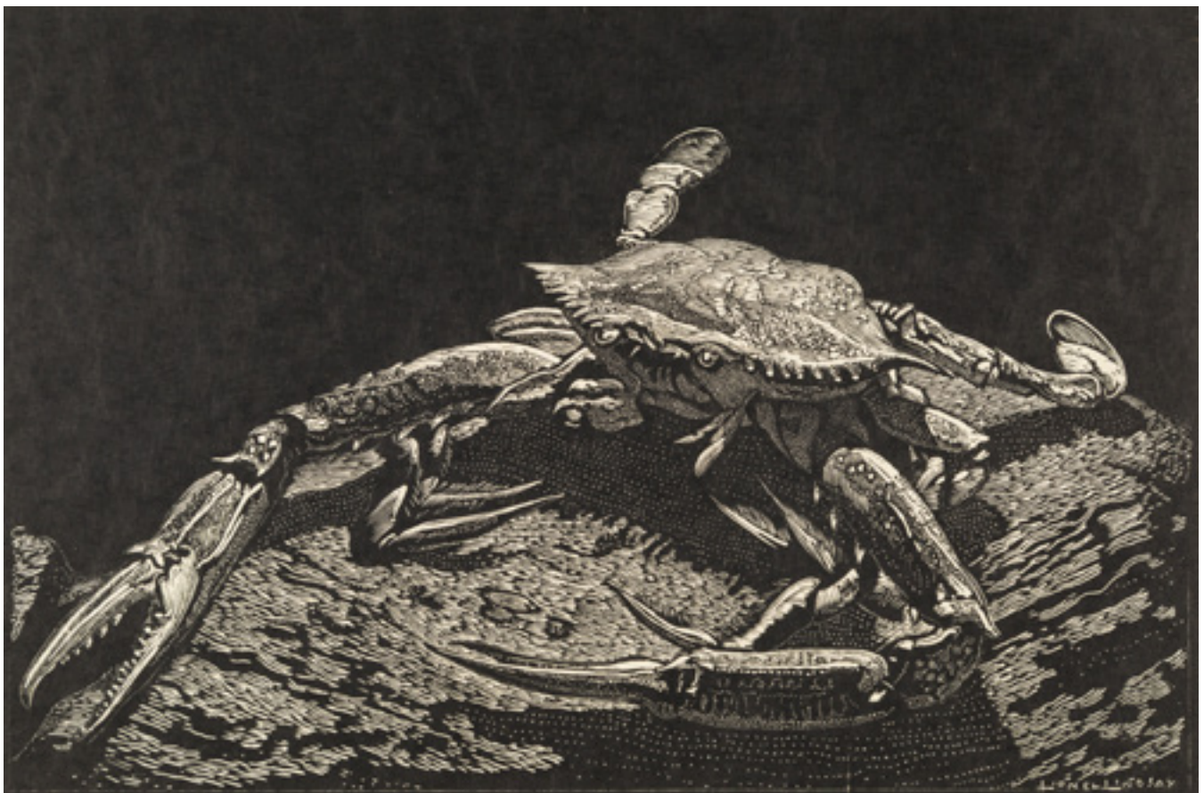
Lionel Lindsay, The Crab , 1931, Wood engraving, printed in black ink on paper, 14.4 x 21.6cm

FROM THE MAITLAND REGIONAL ART GALLERY COLLECTION