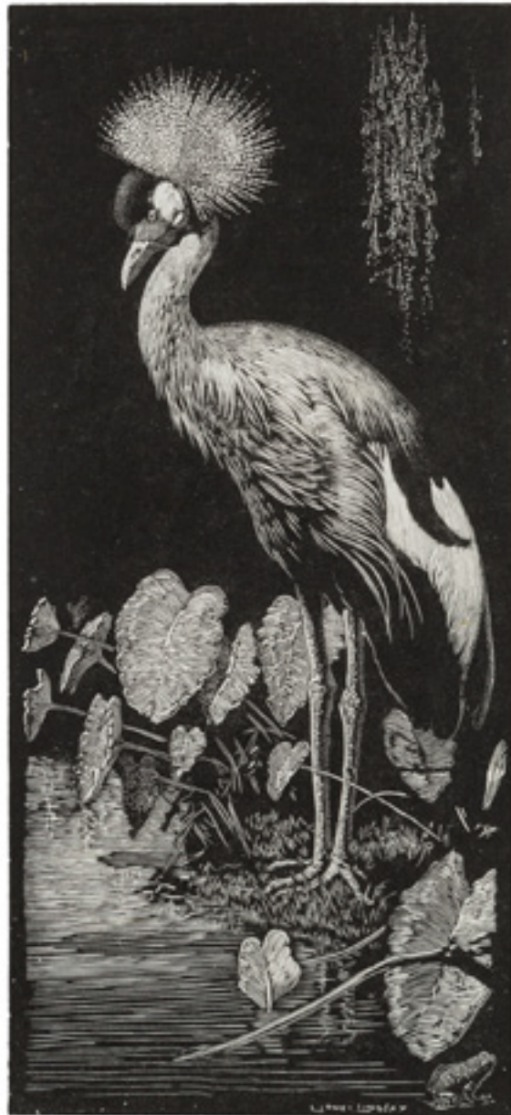
Lionel Lindsay (top left) Hornbill , 1932, wood engraving, printed in black ink on paper, 14 x 14cm. (lower left) The Night Heron , 1935, wood engraving, printed in black ink on paper, 13.4 x 13.4cm. (right) Crested Crane , 1936, wood engraving, printed in black ink on paper, 20.1 x 9.2cm.