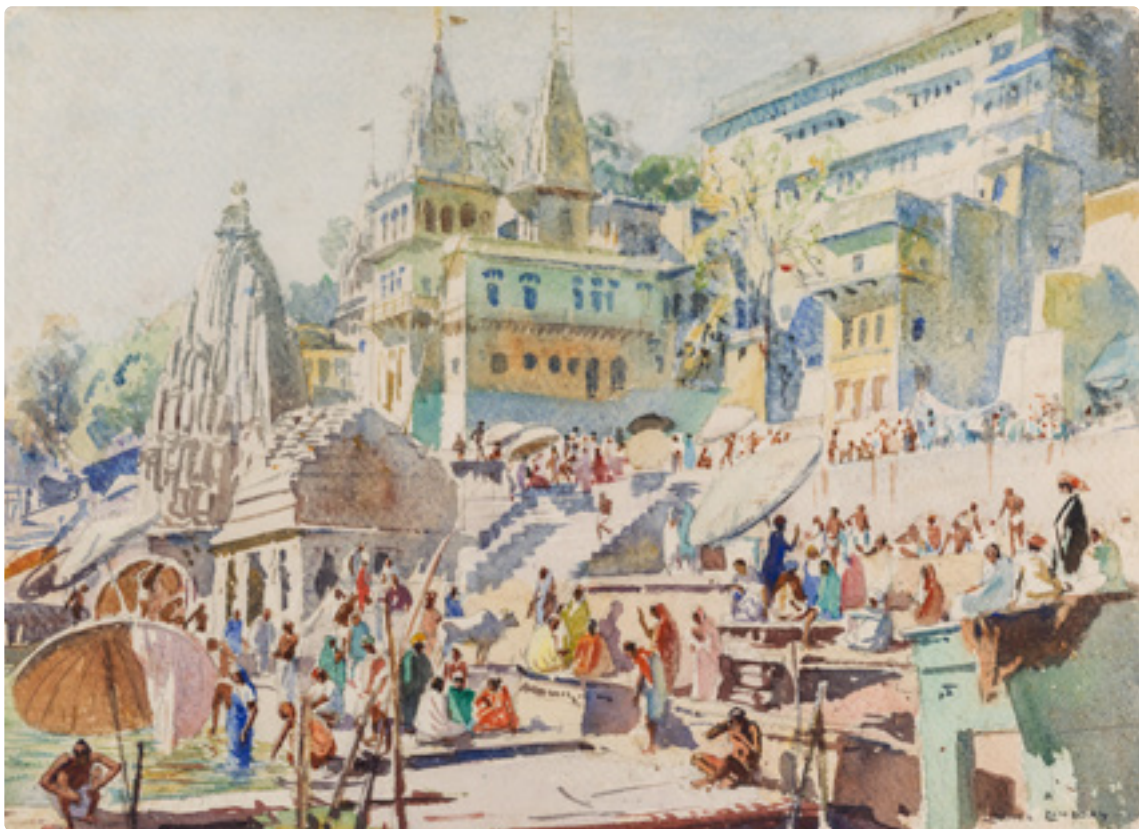
Lionel Lindsay, Varanasi India , c.1930, watercolour on paper, 27.5 x 38.5cm.