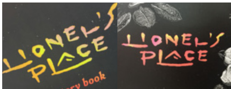
Detail of clear holographic foil on publication covers.