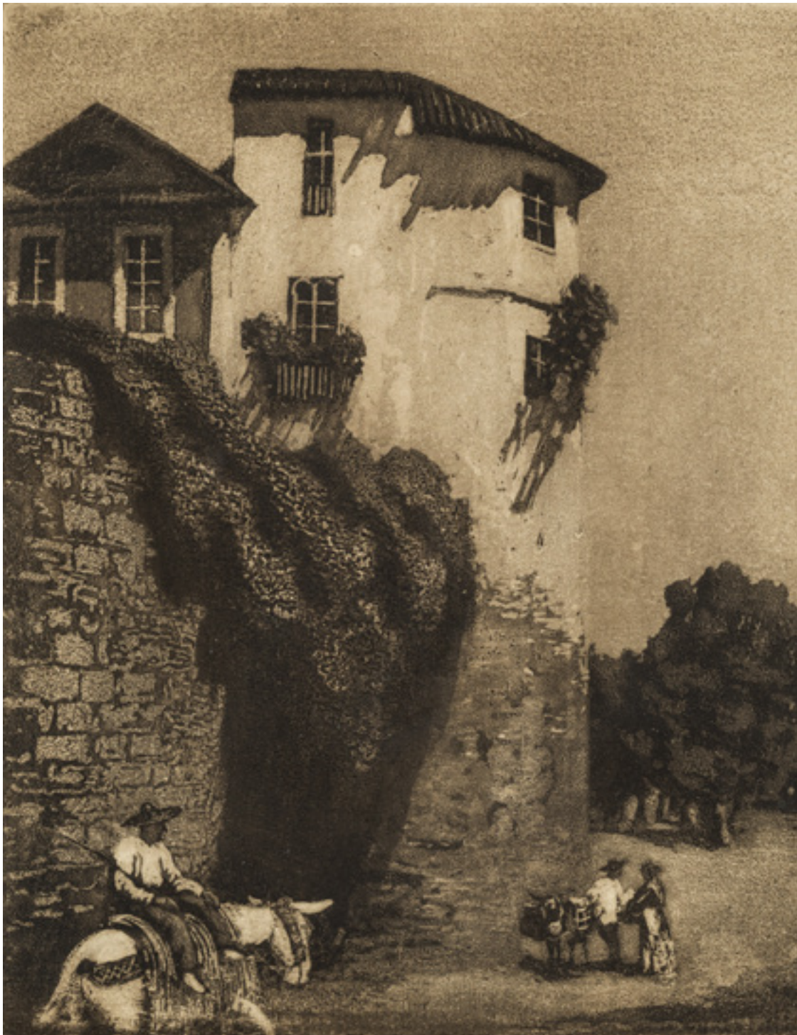
Lionel Lindsay, The house on the wall, Cordova , 1923, spirit aquatint, in black on paper, 18.5 x 15.7cm.