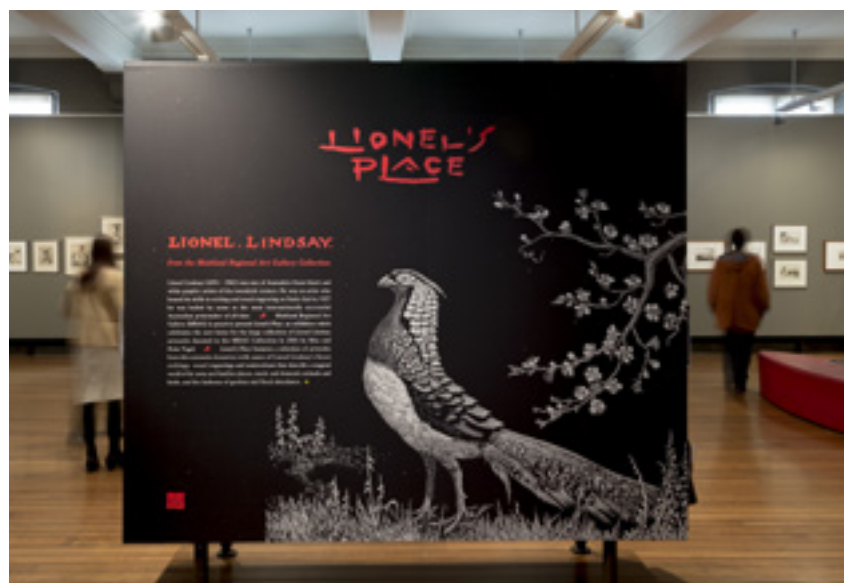
Entry panel in Lionel's Place exhibition space.