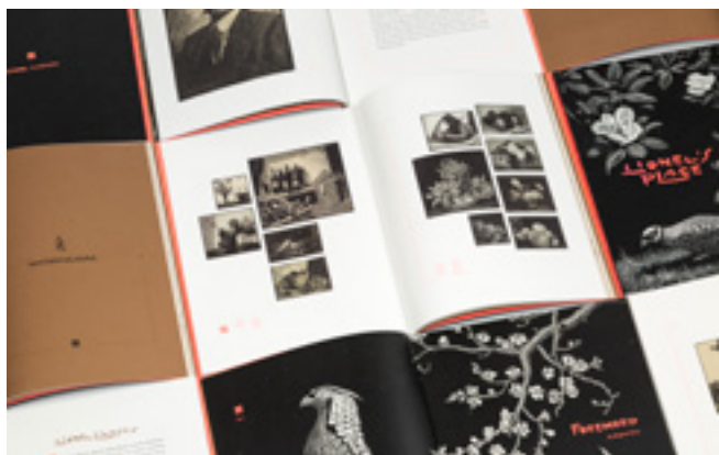
Selected spreads from Lionel's Place Catalogue.